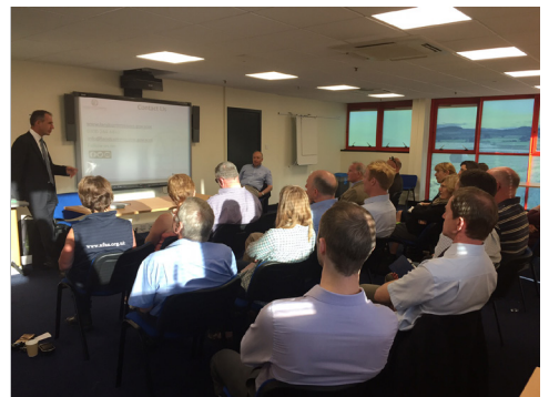
Public meeting at Inverurie